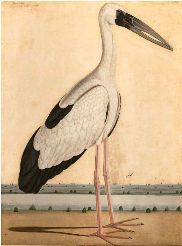
Asian Openbill Stork in a Landscape, Lucknow, c. 1780 Courtesy Private Collection (Photo: Margaret Nimkin)