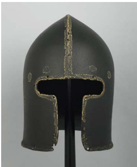
Sallet or Barbuta North Italian, c. 1450