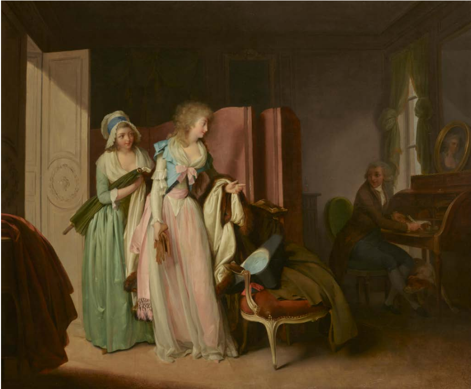
Louis-Léopold Boilly, La visite rendue (The Visit Returned) , France, c. 1789