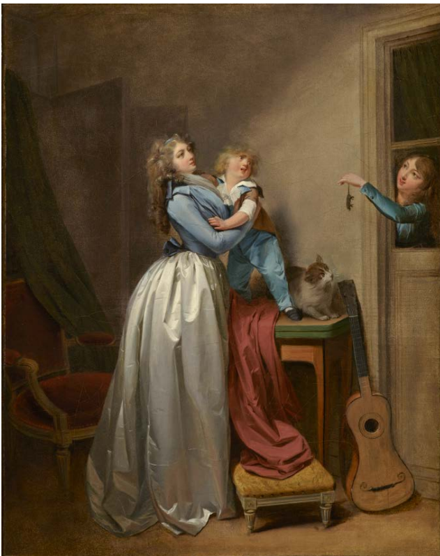
Louis-Léopold Boilly, The Dead Mouse , France, 1780s or 1790s