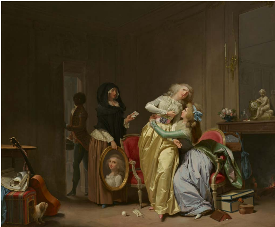
Louis-Léopold Boilly, Les Malheurs de l'amour ( The Sorrows of Love ), France, 1790