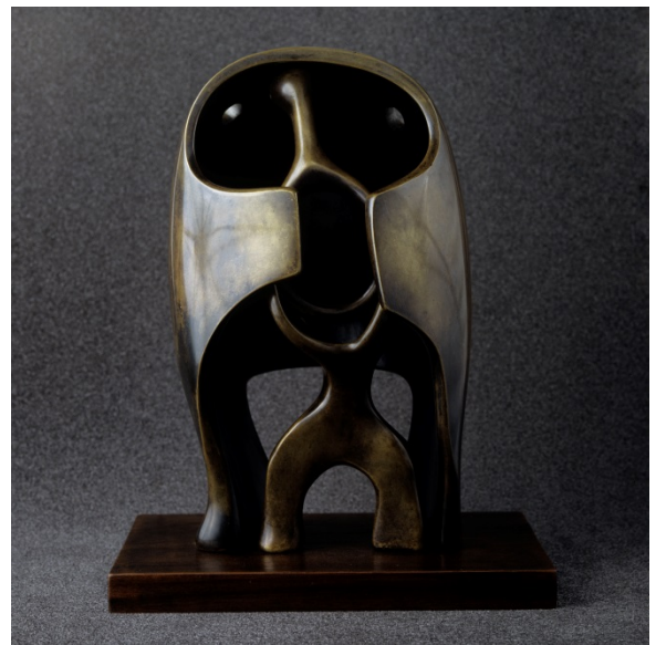
The Helmet 1939-40 bronze (LH 212) Reproduced by permission of The Henry Moore Foundation Photo: Henry Moore Archive